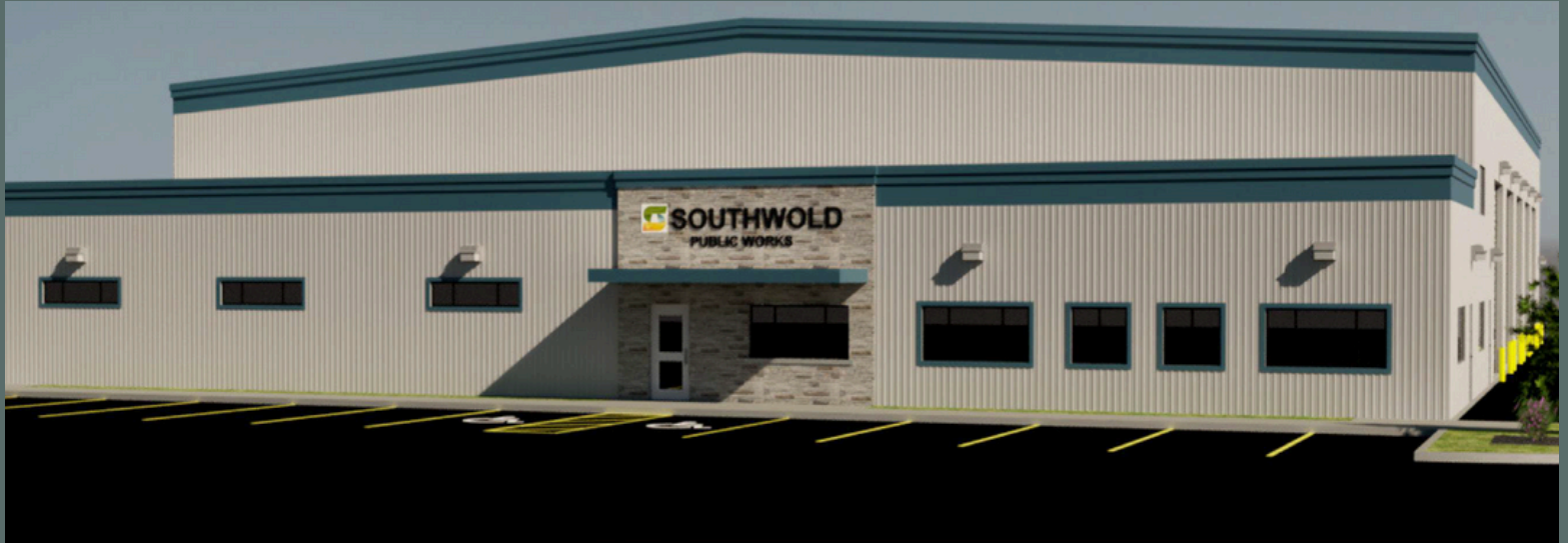
Public Works Building