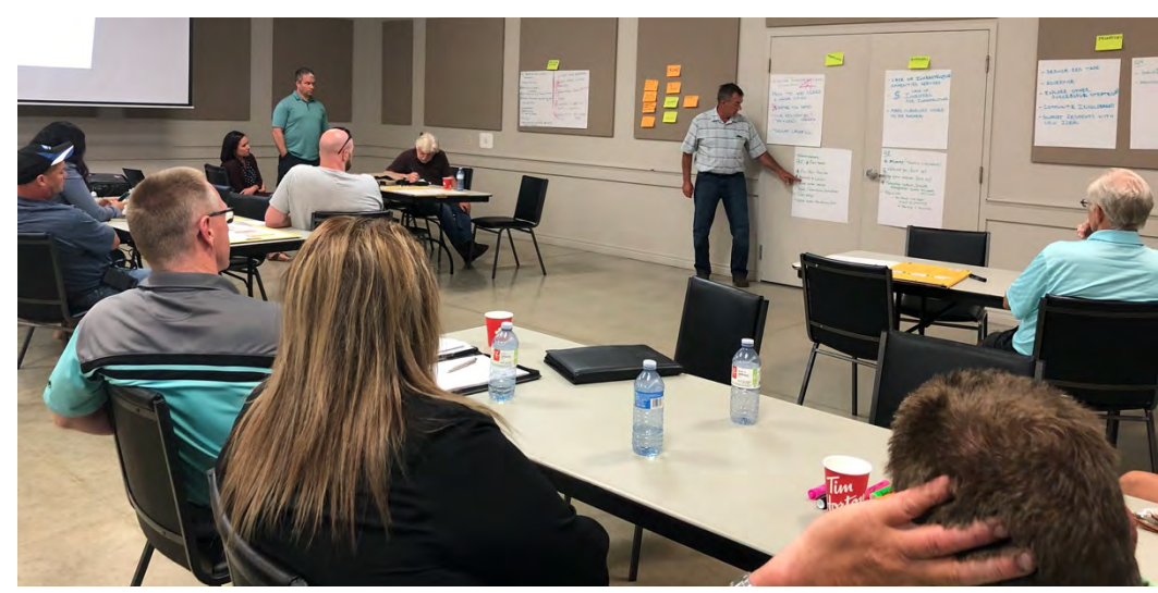
Community Workshop July 10, 2019